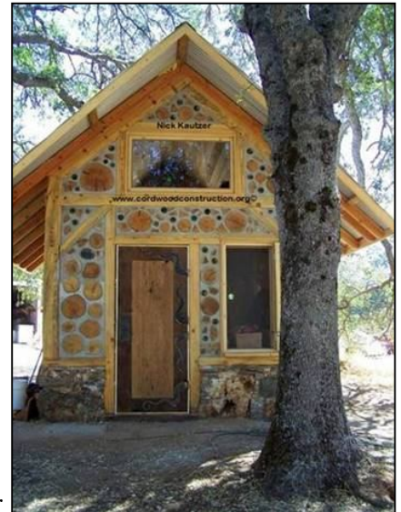
Nick Kautzer's gorgeous timberframe and cordwood cabin in California.

ing...the link to the whole article is on the wordpress blog! Check it out.